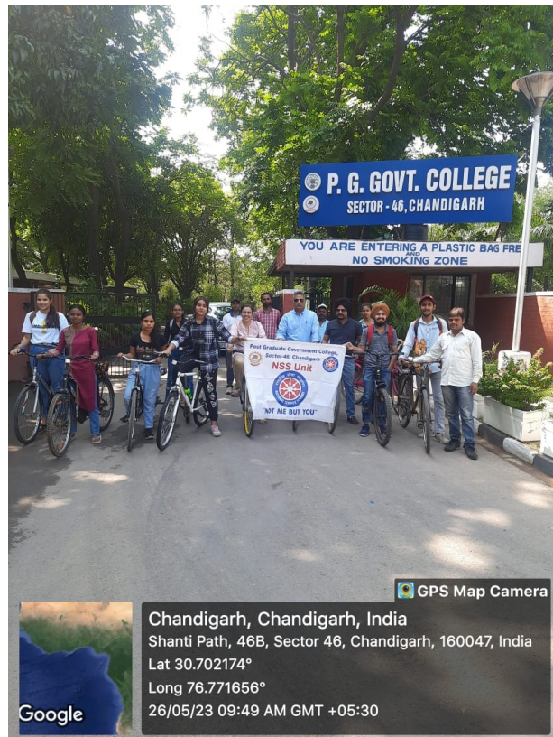
Cycle Rally by NSS unit