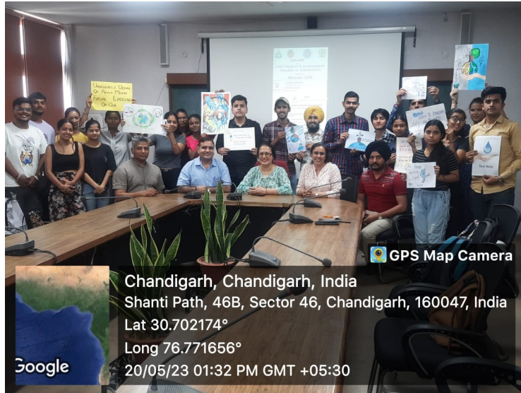
Mission: Life Poster Making Competition