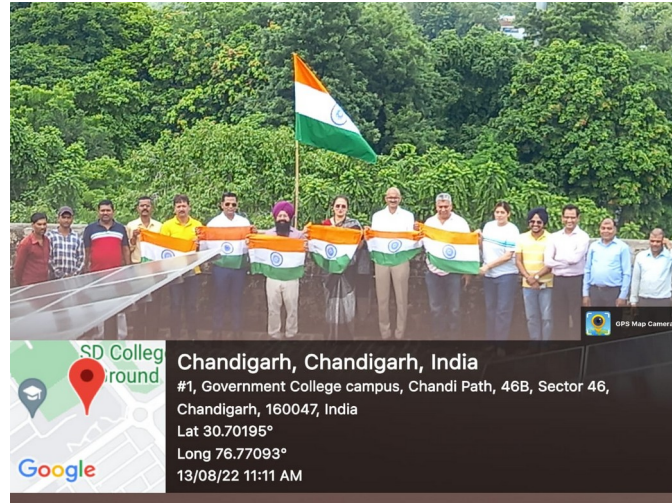
Har Ghar Tiranga Campaign