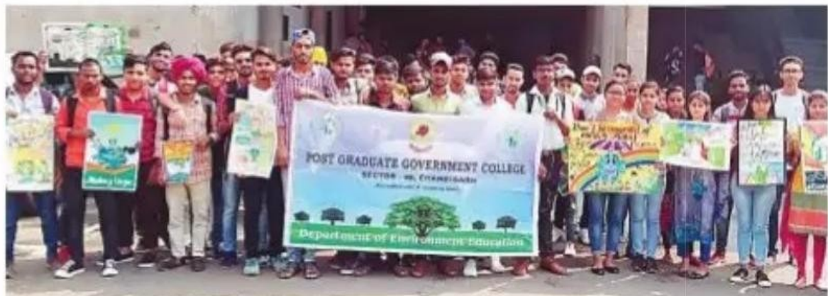
Pledge to Save Environment, 22 Oct, 2019