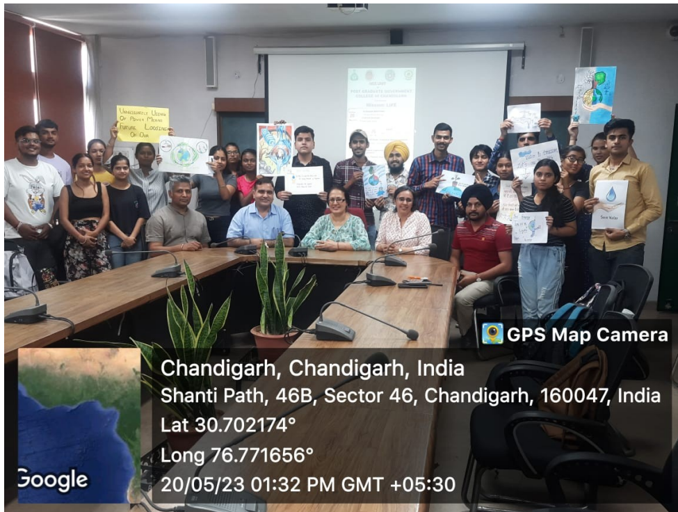
Poster Making Competition 20 May, 2023