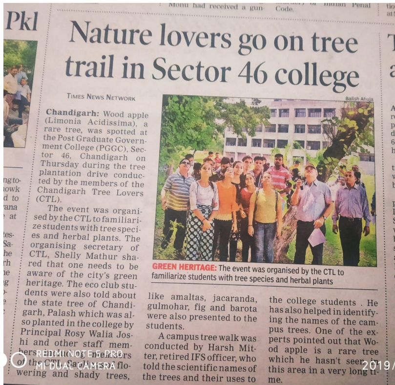
Chandigarh Tree Lovers Tree Walk, 22 Aug, 2019