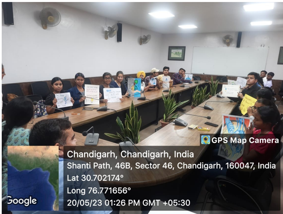
Poster Making 20 May, 2023