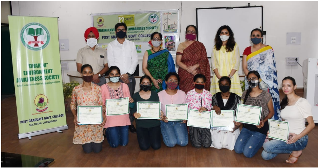
Inter-College Environment Awareness Competition, 22 Apr, 2021