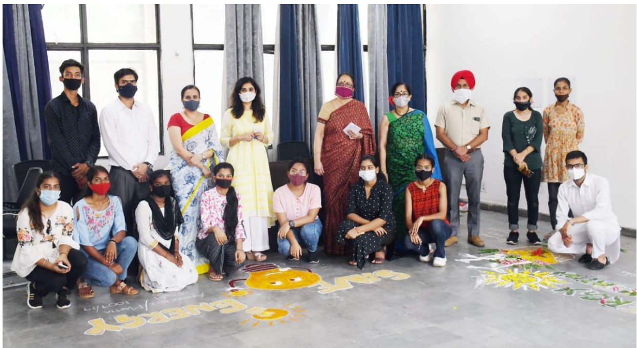
Rangoli Making Competition, August 25, 2021