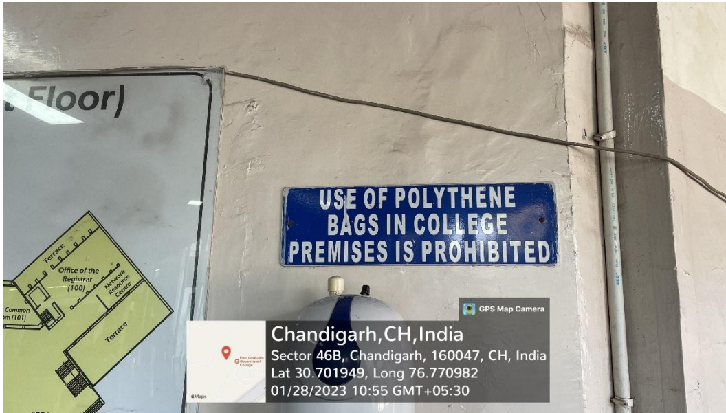
Displays Discouraging Use of Plastic Bags