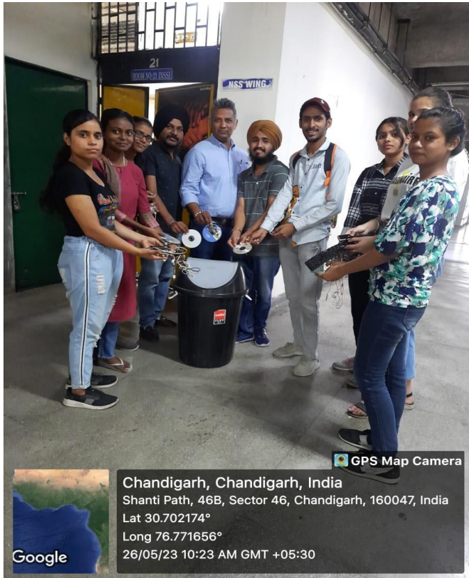
Bin for E-waste Collection