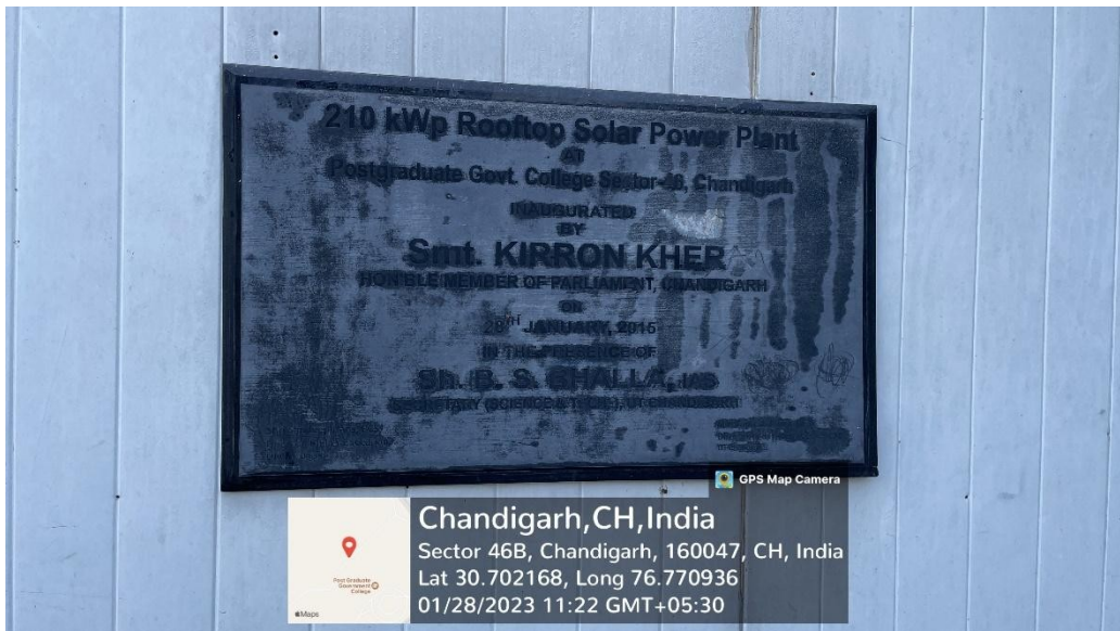
Rooftop Solar Plant