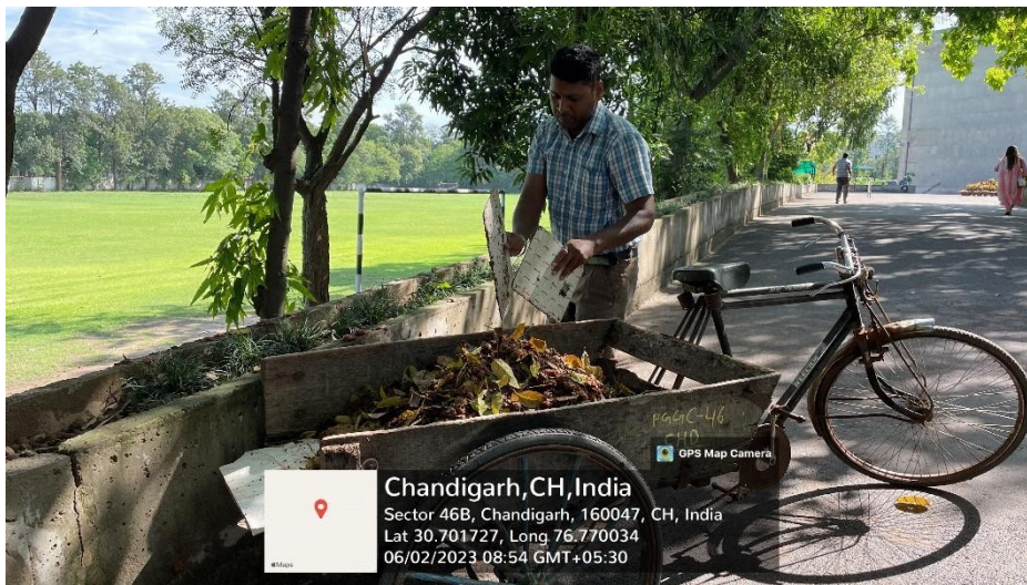
Collection of Dry Waste