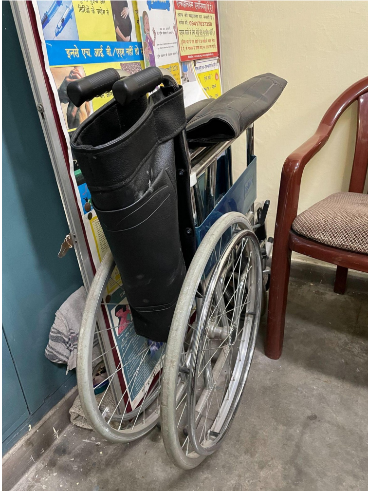
Wheelchair for the Differently Abled Students