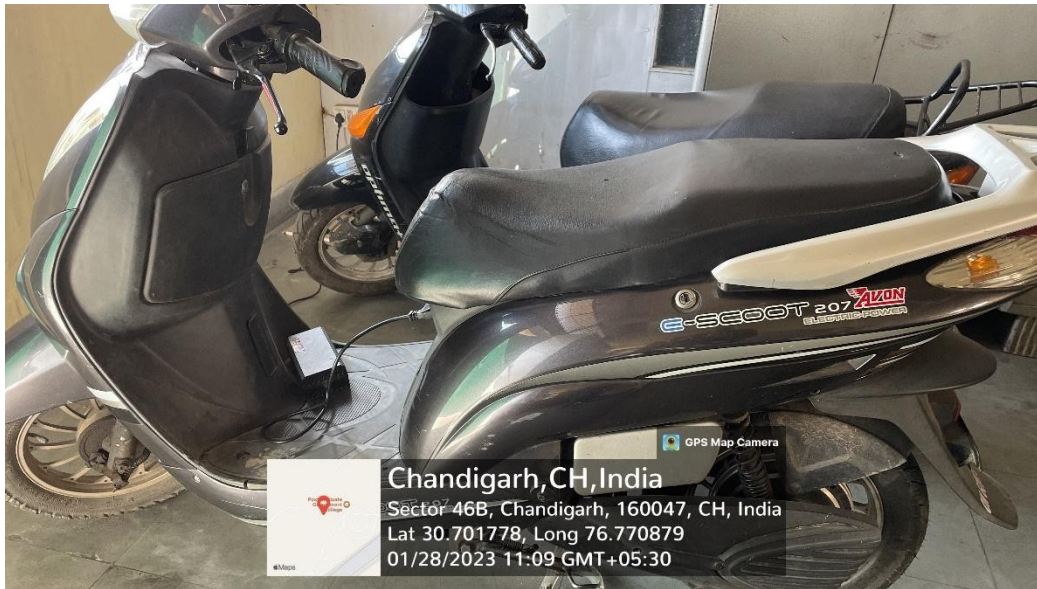
E-Scooter used as Official Vehicle in the College