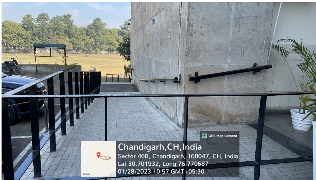
Ramp for Easy Access for the Differently Abled