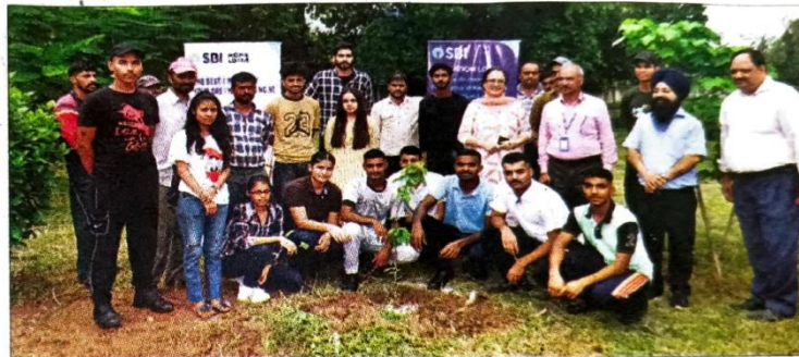
कॉलेज परिसर में पौधा लगाते हुए।

कॉलेज के एनसीसी विंग के कैडेट्स व स्वयंसेवकों द्वारा समूह रूप से कॉलेज परिसर में 50 फलदार वृक्ष